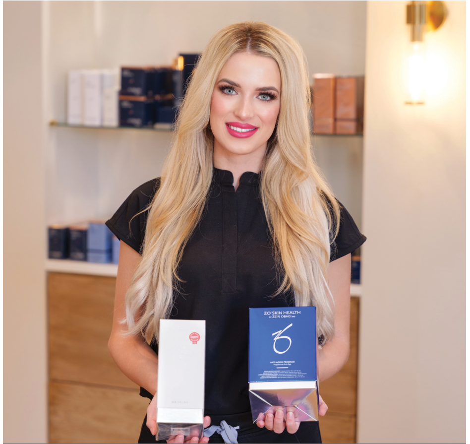
"Consistency is key."