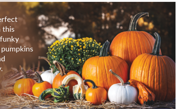
Pumpkins and Gourds available from Little Country Greenhouse, MerchantHouse, and H&N

Pumpkins and gourds are perfect for displaying on your porch this month. I especially love the funky white and green ones. Grab pumpkins of different sizes, shapes, and colors for a balanced display.