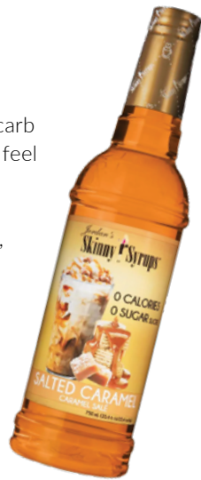
Salted Caramel Skinny Coffee Syrup available for $8 via Dreidel

Nothing says cozy weather like a good throw. These are perfect to use as functional decor. Throw over a bed or couch and use as needed! Cozy Tiger Throw available for $62 via Lindsay Kate Designs